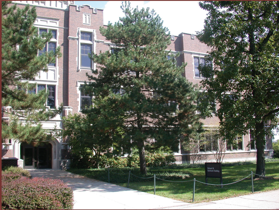
National Office of Lambda Alpha is located in the Burkhardt Building shown in this photograph, on the Ball State University campus.